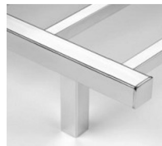
Example of finish

Typically a concealed cord entry is used for a new home or new bathroom installation where no existing outlet is present .